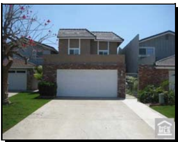
Bank owned sale

Very Clean One Story Waterfront Home with 3 Bedrooms and a Den. Newer Kitchen and Baths, Spa, Private Deck and Dock. Enjoy a Private Membership in the Exclusive Sun and Sail Club with Pools, Tennis, Volleyball and More. This Home is Great As it is or Could be Used to Build Your Custom Home. This is a Fabulous Buy for a Waterfront Home.