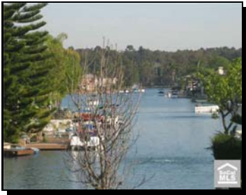
Short sale. NOT on the waterfront.