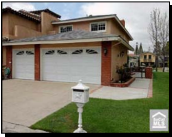
Short sale. Now tenant occupied.

Property is Located in the Desirable Lake Forest Keys. View the Lake from the Family Room, 2 of the Upstairs Bedrooms, Upstairs Balcony, And Backyard Patio. Crown Moulding Throughout the House. Recessed Lights in Kitchen and Living Room. Marble Fireplace, Recently Installed Ceiling Fans, And 17 Inch Tile in Kitchen, Living Room, And Entry. Seperate Laundry Room Inside. Larger