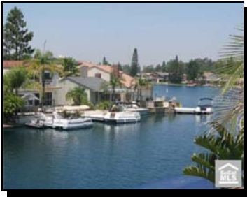
Waterfront - traditional sale

Address: 21917 Erie Lane Active 7/23/2008