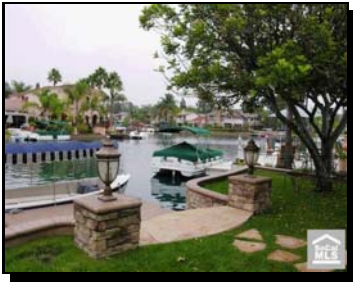
Waterfront. Very cute house! Traditional sale. Came out to $507/sq ft!

Address: 24265 Ontario Lane Sold 3/5/2009