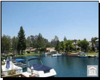
Waterfront - traditional sale.

Hurry! Equity Seller, Bright and Cheerful Darling Cottage Home on Park like Greenbelt. No Lawnmower Needed! Assoc Takes Care of the Front and Back Yards. Lowest Priced Home in the Lake Forest Keys! Beautiful Greenbelt Location on a Private Cds Street. 3Bed/2Ba Open Floor Plan with New Carpet, New Shutters, New Stove, Newer Concrete Roof, Granite Kitchen and Baths. Inside Laundry, New