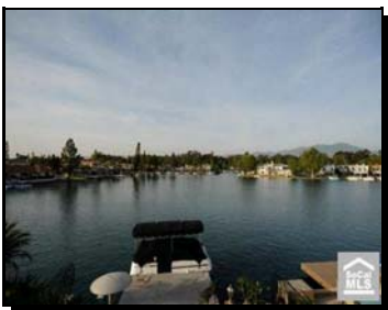
Waterfront - main channel!

Rare End Location on the Waterfront/ Massive Greenbelt with Private Boat Dock. Hugh Front Porch Leading to Grand Entry. Beautifully Remodeled Kitchen/Granite/Wood Floors/Newer Carpet/ Crown Mouldings/Custom Paint/New Renaissance Doors and Windows. 2 Bay Windows Overlooking Fantastic View of Water and Greenbelt. 2 Fireplaces in Cozy Conversation area and Master. Outdoor Living @