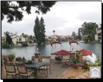
Waterfront - traditional sale

Address: 21922 Winnebago Lane Active 2/11/2008