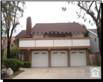
Fixer in original condition.

Address: 25541 Loganberry Lane Active 6/5/2009