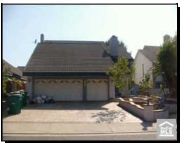
Bank owned REO! Only $202/square foot!

Charming Ranchwood Home in Serrano Ridge Situated on a Very Large Private Corner Lot in a Wonderful Neighborhood! Newly Remodeled with Custom Paint, New Carpet, Mirrored Closet Doors and New Front Door with Tiffany Glass Center Window. Kitchen Offers Recessed Lighting, New Microwave, Dishwasher and Large Picture Window with View of Backyard. Very Open and Spacious Floorplan. Home Also