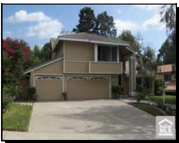
Standard sale. Appointment only due to dogs.

Beautifully Maintained and Updated, Single-Level Home in the Indian Hills Tract of Lake Forest. The Kitchen was Remodeled 4 Years Ago, With New Cabinets, And Countertop, And New Appliances. Large Garden Window At the Kitchen Sit-Up Bar. White Appliances, Corian Counters, And Marble Flooring Thru-Out the Home. The Living Room has a Cozy Fireplace, Updated, Scraped Ceilings, And Crown